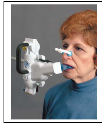
The Swirler's patented air-flow design utilizes shear forces to create efficient atomization. This technology increases the delivery of droplets having the desired size (0.5 to 1.5 microns) to assure a more rapid coating of the alveoli.

Swirler® is a registered trademark of Amici, Inc.